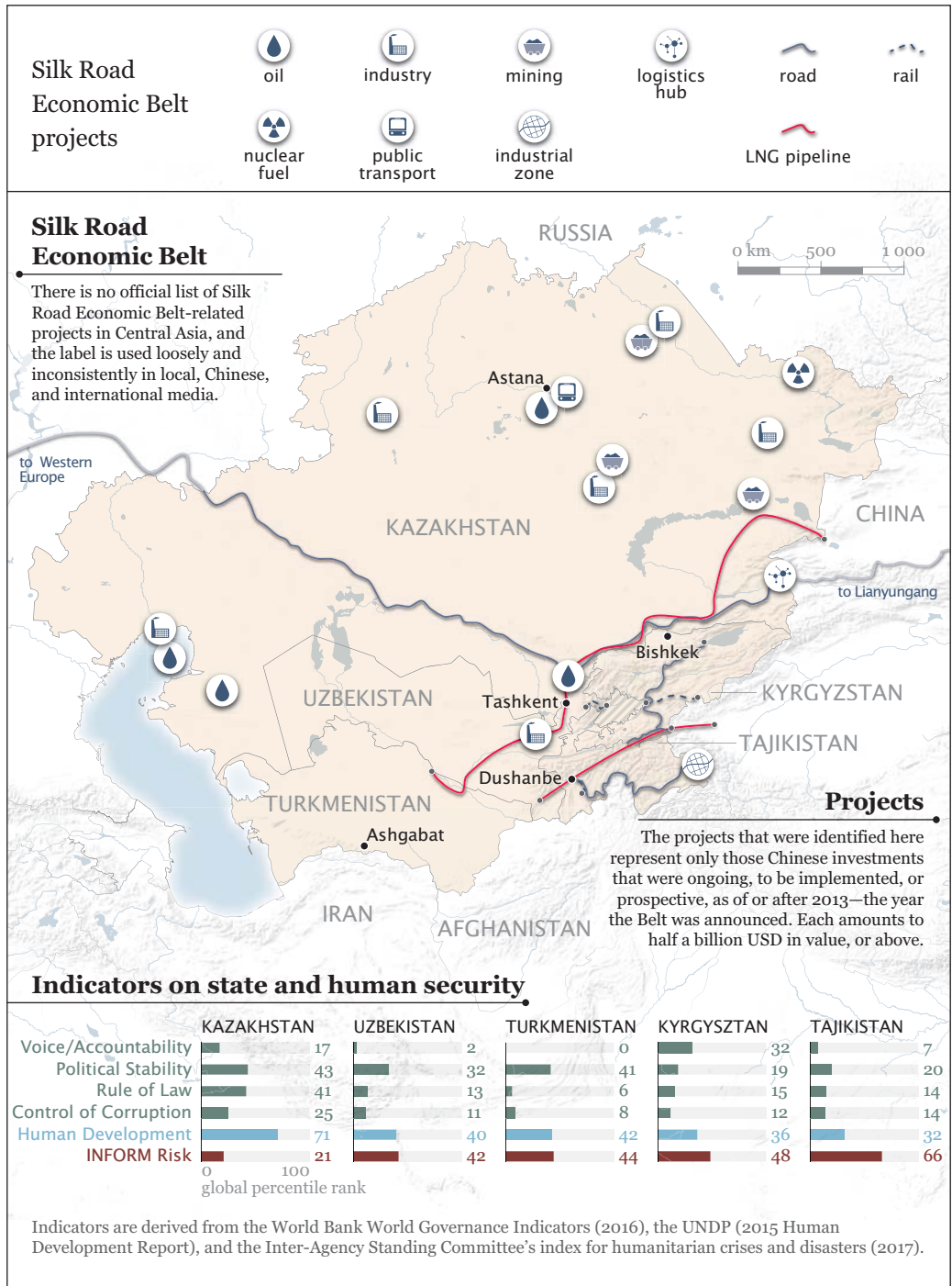
Figure 2.1. Map of Central Asia illustrating Silk Road Economic Belt projects and fragility indicators per state